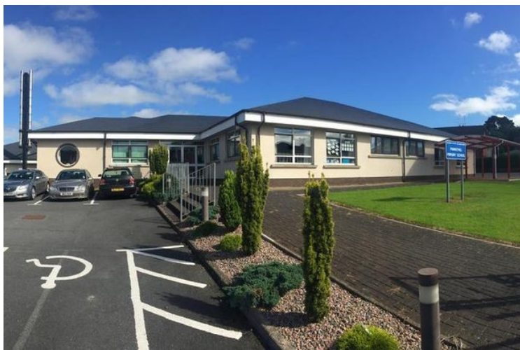
Markethill Primary School

I always look forward to September, meeting new schools, teachers and pupils and as I move into my sixth school year with Sustrans the excitement is building again.