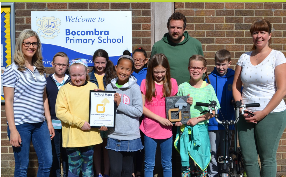
Gold School Mark Recipients

We are currently working with over 340 schools across Northern Ireland. Please visit our website where you can learn more about the programme and download newsletters from other areas.