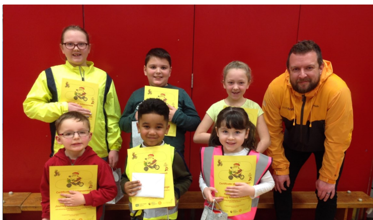
Journey To Santa Year Winners—Millington Primary

It was so much fun delivering a whole school assembly and to award prizes to the pupils for all of their brilliant efforts.