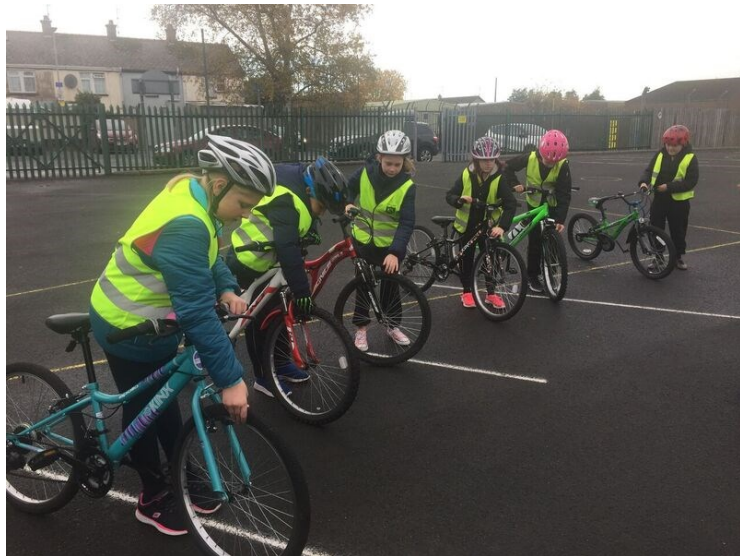
King's Park Pupils Checking Their Bikes

D is for DROP — make sure nothing falls off my bike.